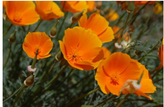
Figure 1. California poppy in bloom, showing unopened bud in left foreground.

Distribution: California poppy is native to the western United States from southern Washington south into Baja Sur, and from the Channel Islands and Pacific coastline east to the Great Basin and regions of the Sonoran Desert (Hickman, 1993).